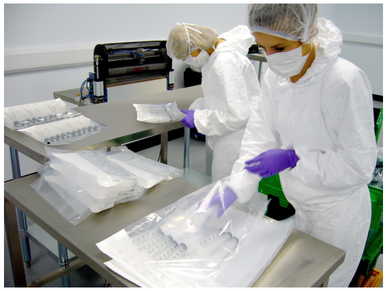
Contract cleanroom packing