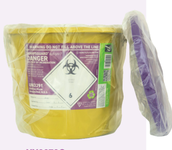
XX0673C 7L • sterile • 4 pcs/pck XXTB0673C triple bagged 7L • sterile • 4 pcs/pck