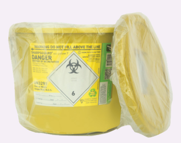
XX0473A 7L • sterile • 4 pcs/pck

Helapet Limited | Lister House | Blackburn Road | Houghton Regis | Bedfordshire | LU5 5BQ Web: helapet.co.uk | Phone: +44 (0)1582 501980 | Email: sales@helapet.co.uk